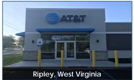
Ripley, West Virginia