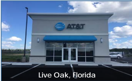
Live Oak, Florida

Prime is the largest, privately held AT&T Authorized Retailer in the nation with more than 650+ stores in 26 states from coast-to-coast.